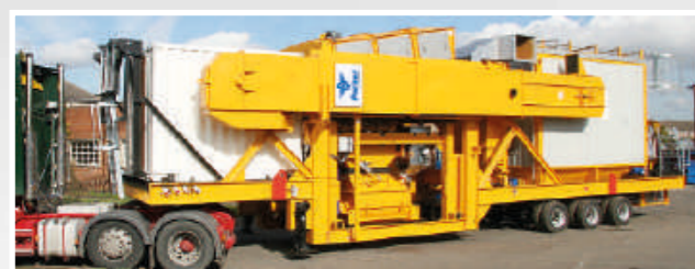
Mobile control cabin, mixing section including primary and secondary dust