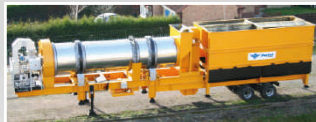
Mobile cold feed unit, dryer and burner

Installation and erection of the main components is achievable in four hours and with the addition of a bitumen tank and reclaimed filler silo the plant can be put into full production within a day of arrival on site